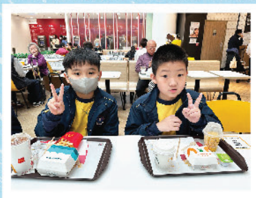
Speech Therapy Group - Community Treasure Hunt