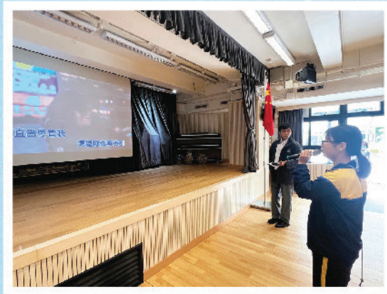
Using GULU machines during recess